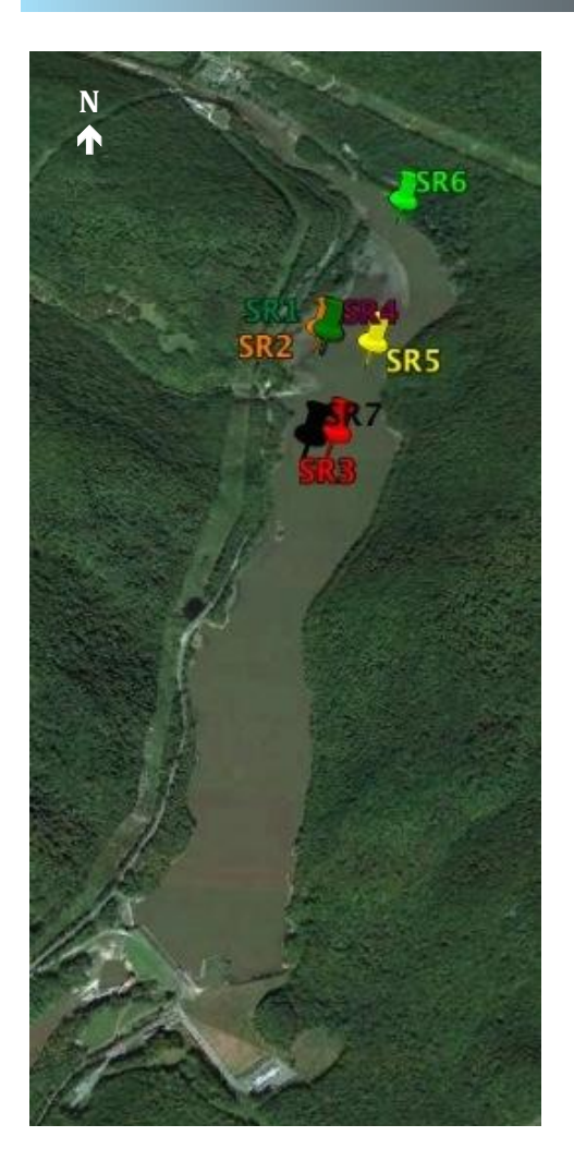
Figure 2: Aerial view of Sherman Reservoir with core locations; cores were collected in the northern half of the reservoir, as the southern half was inaccessible due to dam and hydropower operations. Note the South Branch of the Deerfield River entering the reservoir from the west.

area of 82.4 square kilometers before entering the main Deerfield at Readsboro, VT (Herzfelder, 2004). Three additional tributaries also enter the Deerfield below Harriman Dam, including the South Branch of the Deerfield River, which enters the reservoir directly just north of the state border. Therefore, much of the sediment entering Sherman Reservoir is probably transported by the West Branch, the South Branch, and minor tributaries, as water residence time behind Harriman Dam is likely to remove most bedload and suspended sediment from the water column. As a result, any event signatures likely reflect erosion and transport in this 129.5-square kilometer subwatershed.