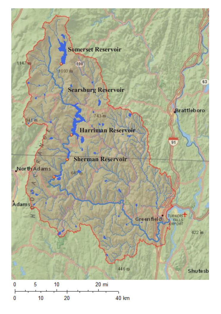
Figure 1: Map of the Deerfield River watershed (Deerfield River Watershed Association). Major dams are marked with orange circles, and Sherman Reservoir and the reservoirs upstream of it are labeled.

Table 1: Hydroelectric facilities on the Deerfield River (Gomez and Sullivan Engineers, P.C.); note the three reservoirs upstream of Sherman Reservoir that affect the Deerfield's discharge entering Sherman Reservoir.