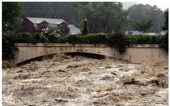
Figure 1. Tropical Storm Irene caused record high discharge on the Deerfield River observed here at the Bridge of Flowers in Shelburne Falls, Massachusetts.

Tropical storm Irene was an anomaly with respect to sediment delivered to the river system. By concentrating the heaviest precipitation in the mid to upper reaches of the river, Irene remobilized significant glacial-lacustrine sediments and