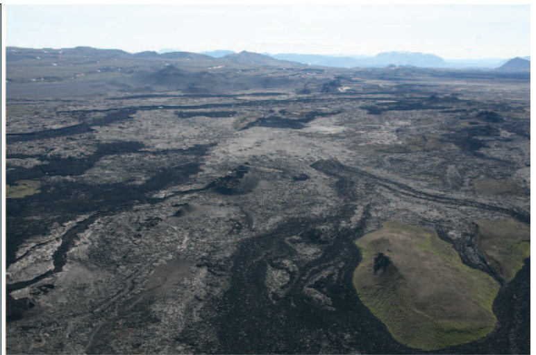
Figure 1. Geological map of Iceland showing the location of volcanic terrane younger than 1100 years (pink) and the Krafla Central Volcano (star) in the Northern Rift Zone (NRZ). SISZ- South Iceland Seismic Zone; TFZ- Tjörnes Fracture Zone. Hatched lines show major rift zones. Image to right shows a view to the south of young volcanic terrane just north of Krafla.

were designed to investigate processes associated with specific features that were well characterized in the 1984 Krafla lava flow field.