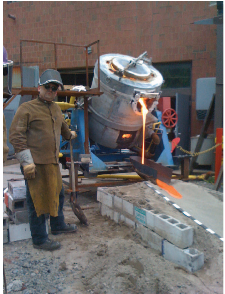
Figure 2. Gas-fired tilt furnace operated by Professor Robert Wysocki for lava flow experiments in the Syracuse University Lava Project.

The Krafla Fires eruption of the 1970's and 1980's in northern Iceland produced basaltic lava flows fed by eruptive fissures and small craters and a spectacular array of volcanic features (Fig. 1). The main eruptive centers and nearby areas were used as natural laboratories for the study of basaltic lava flows. Detailed examination of selected features of these lava flows resulted in the formulation of specific research questions and hypotheses for their mode(s) of formation. These questions were the basis for designing experiments to simulate the conditions under which they formed with basaltic lava at